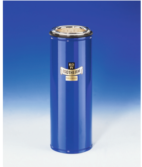
Dewar flask 9 C